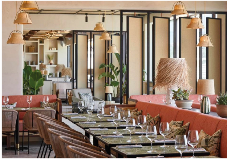
Beefbar Malta

After the success of the first Beefbar in Monaco, the concept has gone global. Proposing an intimate ambiance reminiscent of gentlemen's and wine tasting clubs, the restaurants worldwide use materials that are simple, raw and premium: black wood and bronze panels, Humbert & Poyet-designed alabaster lighting, natural granite bars, earth-toned leather walls and Murano glass chandeliers.