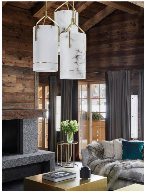
Gstaad Chalet