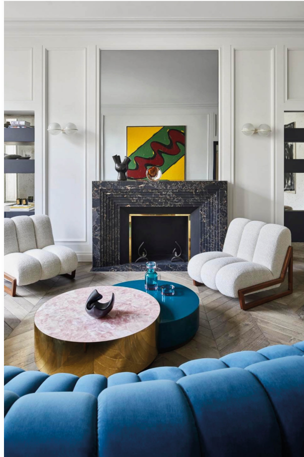
Rue des Archives apartment in Paris

Inspired by the modernist, Art Deco and Memphis movements, paired with classicism, Humbert & Poyet used marble, terrazzo, wood and brass to create a sophisticated family home conducive to entertaining decorated with beautiful moldings, an elegant chimney, mid-century and contemporary furniture and modern art.