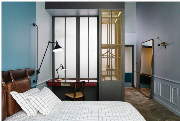
The Hoxton Paris

Following on from London and Amsterdam, the 171-room hotel pays homage to French craftsmanship from two crucial eras in Parisian history: the late 19 th century and the 1950s. The guestrooms combine a classic Parisian spirit with a 1950's atmosphere referencing small industrial workshops, while the cornices, wainscoting and herringbone parquet evoke the building's original 18 th -century grandeur.